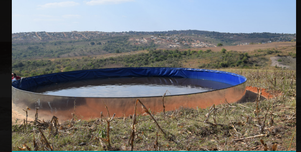
Hathi Endlela Primary Cooperative - Page 21