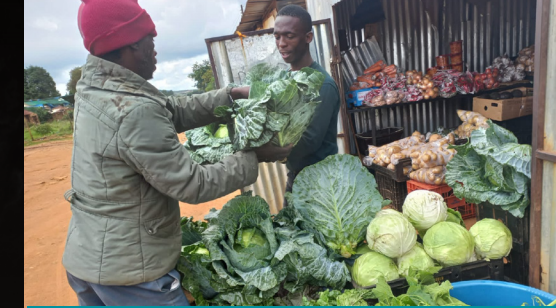
Intandekho Agricultural Primary Cooperative - Page 15