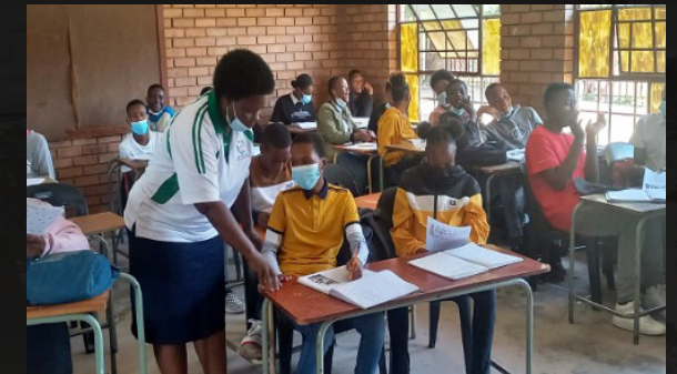
The Greater Rape Intervention Programme - Page 25